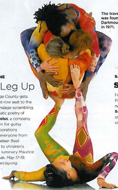
The traveling troupe was founded at Dartmouth College in 1971.

Back in 1969, pre-Burning Man, a showdown between two artists along Ferndale's Main Street spawned The Kinetic Grand Championship . Human-powered vehicles embark on three days of bicycling over 42 miles of variegated terrain and stormy seas. What's now dubbed the Triathlon of the Art World awards prizes for breaking down, flipping and the big one: mediocrity. May 26-29; kineticgrandchampionship.com.