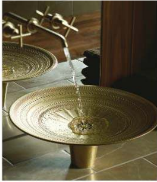
Inspired by Southeast Asian tribal rain drums, Kohler's Kamala vessel sink is cast in bronze and will patina over time.