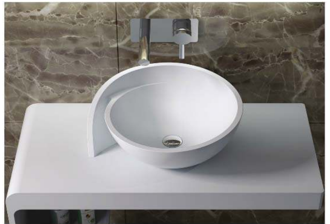
Handcrafted from a composite stone resin, this sink has curves in all the right places and is available in glossy or matte white from ADM Bathroom Design.

Simple and elemental, concrete is a robust choice. It also is adaptable. You can custom fabricate concrete into any sink shape or buy one readymade. With many different design options and color stains available, the possibilities are myriad. Made from sand, rock and cement, concrete is heavier than most other materials, so it will need sufficient support. Environmentally friendly concrete mixes provide a green alternative.