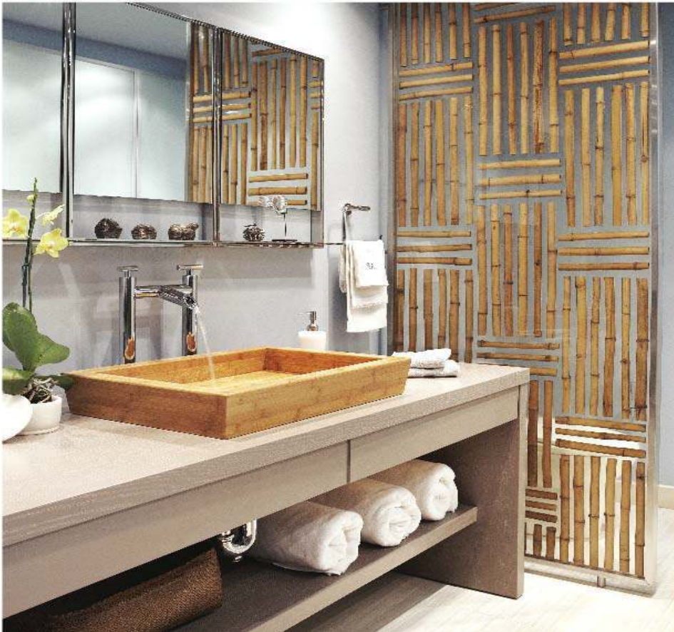
A large Moso Bamboo Vessel sink from Stone Forest adds a Zen and spa-like feel to a bathroom.

Give your bathroom faucet a reason to rejoice