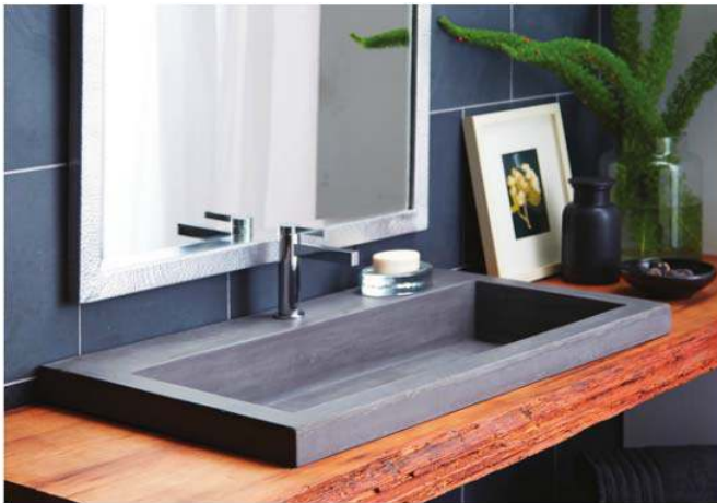
Communal trough sinks from years past are popping up everywhere, offering a distinctly rustic look. Native Trails' 36-inch sink is handcrafted from NativeStone, a blend of cement and jute fiber.