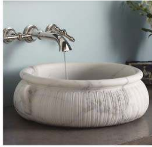
The Kasos decorative vessel — designed by Michael S. Smith for Kallista — is sculpted from Calacatta Borghini marble.

Metal workers transform brass, copper and stainless steel into polished looks, while bronze casters make sinks that can moonlight as sculptural art. Whether artisan made or manufactured, textures can be hammered and rough or polished and shiny. Metal sinks stand up to wear and tear, though higher-gauge metals are thinner and more likely to dent.